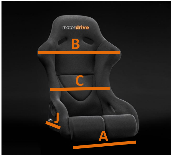
Pro Sim Standard